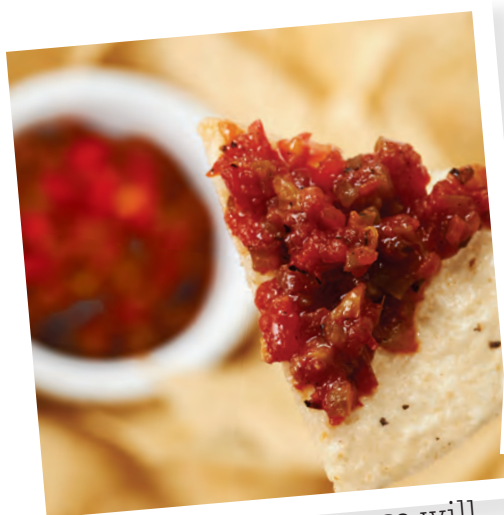
Salsa and tomato sauce will not stain!

We're confident that this printing process will take whatever is thrown at it.*