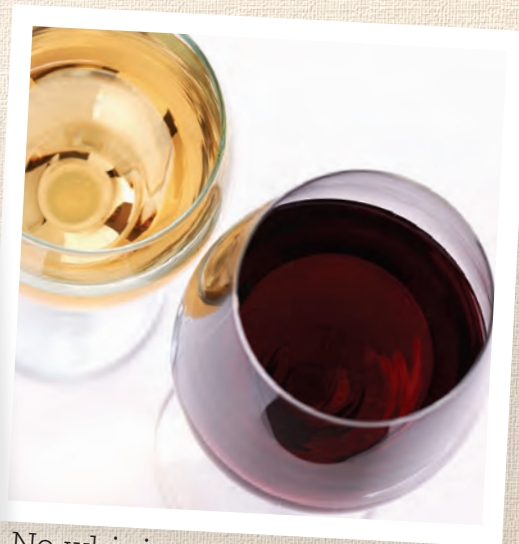
No whining over wine. Put an end to red rings.

*We've tested this menu printing process to withstand many hazards that occur in a restaurant. All tests yielded perfect results when cleaned/wiped-down within 12 hours. We sat on them, we tried to rip them, we poured every conceivable liquid and substance on them, and still they looked good. Suffice it to say, if the testers were treated that way, we wouldn't do so well.