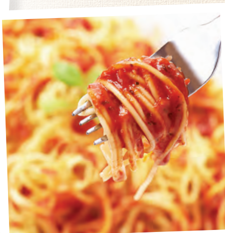
Pasta is no contest. Ciao baby!