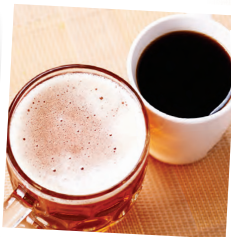
Beer or coffee has no effect.